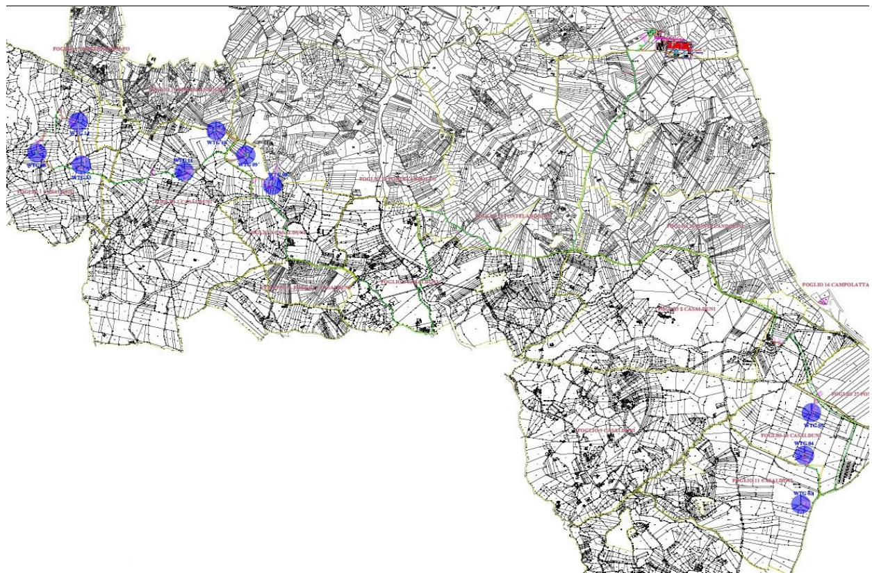
Figure 3-1 – Layout of all WTGs and SSE

All the WTGs are located in Municipality of Casalduini, grouped into two clusters: WTG03, WTG04 and WTG05 belonging to the first cluster and the WTG08, WTG09, WTG10, WTG11, WTG13, WTG14 and WTG18 are in second cluster, while the SSE is located in the Municipality of Pontelandolfo, nearly the existing substation RTN.