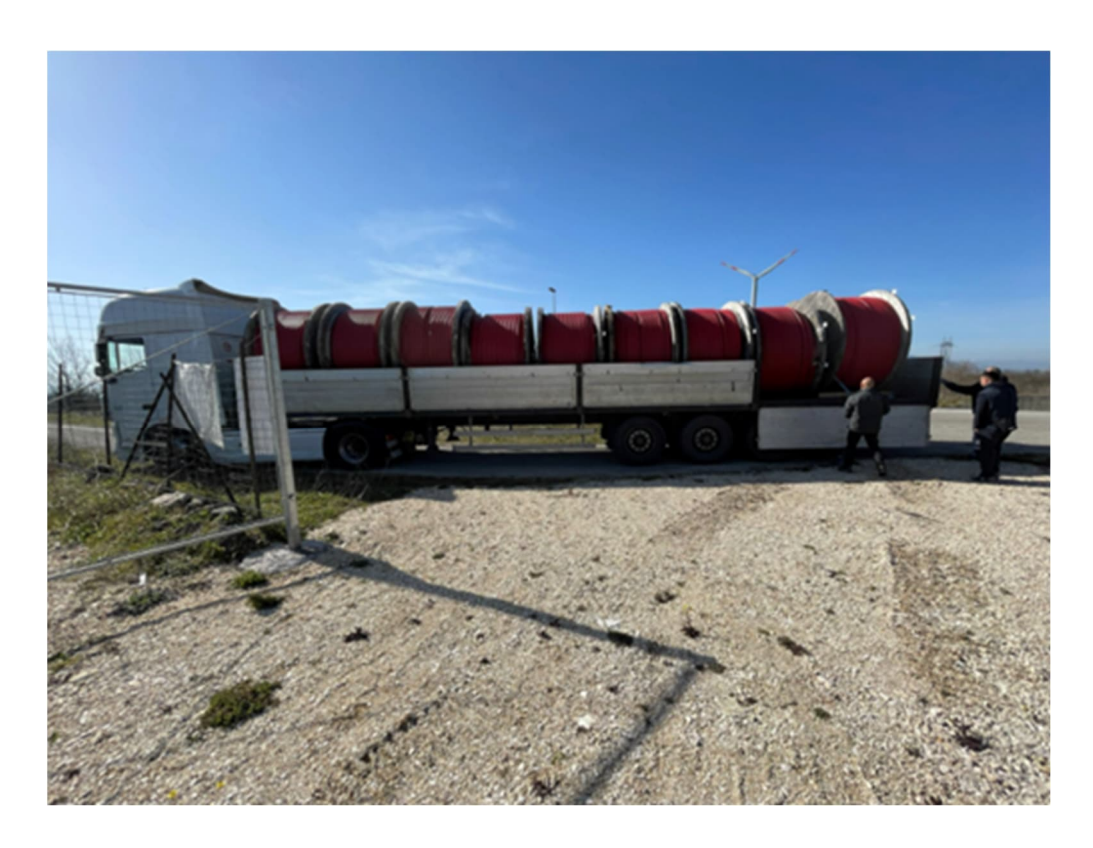
Figure 11-2 - Start of MV Cable delivery activities at site