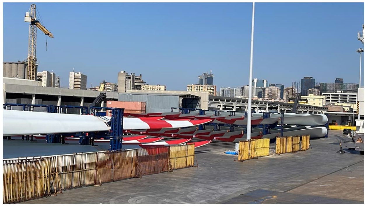
Figure 11-1 - WTG Blades at the port of Naples