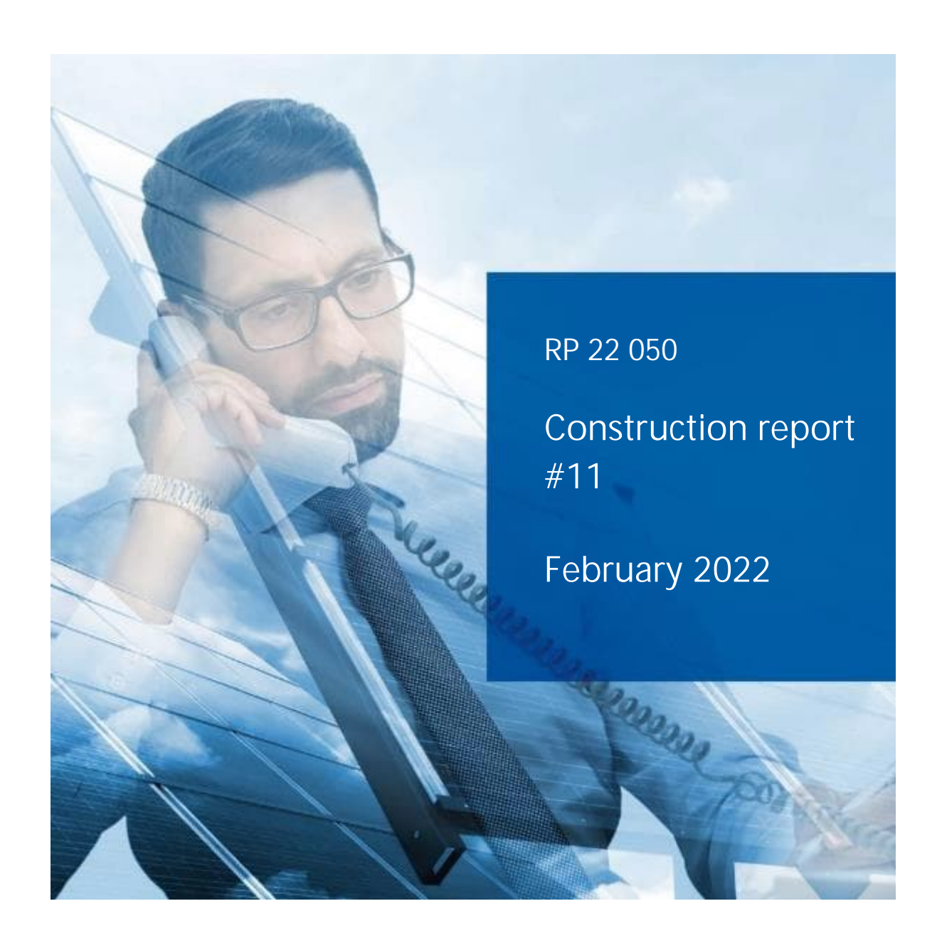
Casalduni 34.7 MW Wind Farm, Campania, Italy