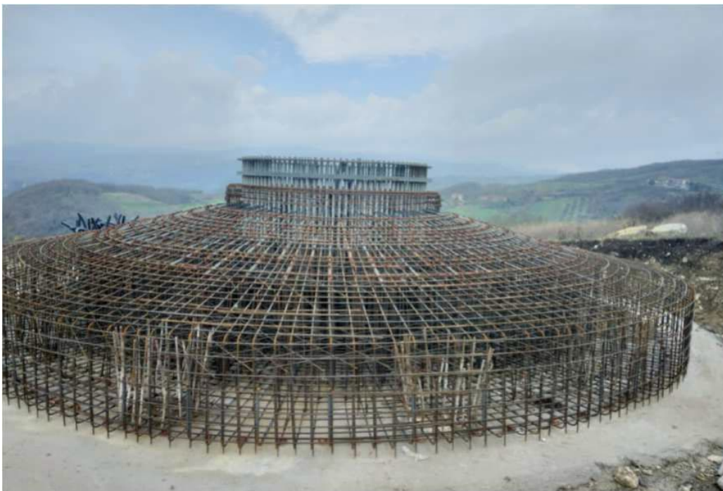
Figure 11-2 - WTG G14 foundation works ongoing