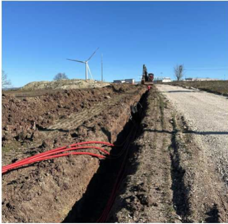
Figure 11-3 - MV cables works