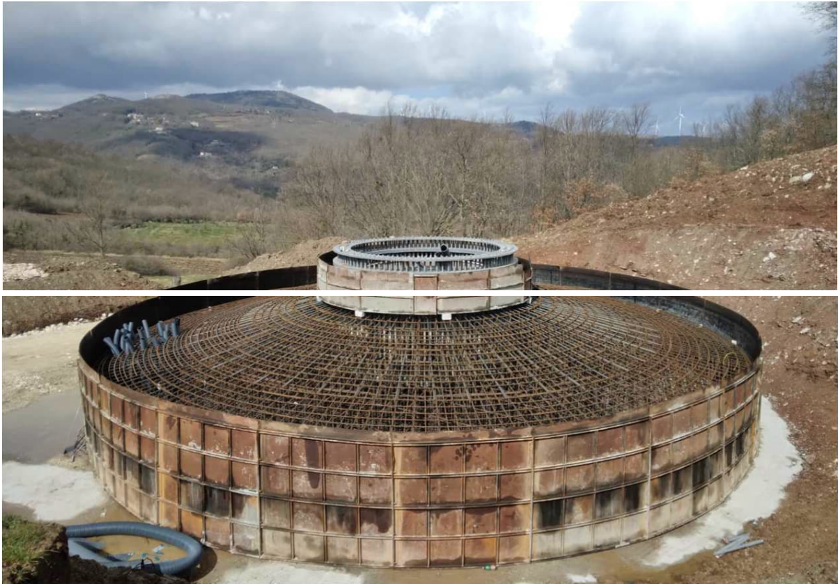
Figure 11-1 - WTG G14 ready to be poured

Some selected pictures of the site works and materials delivery, as shared by the Sponsor [4], are provided in this section.