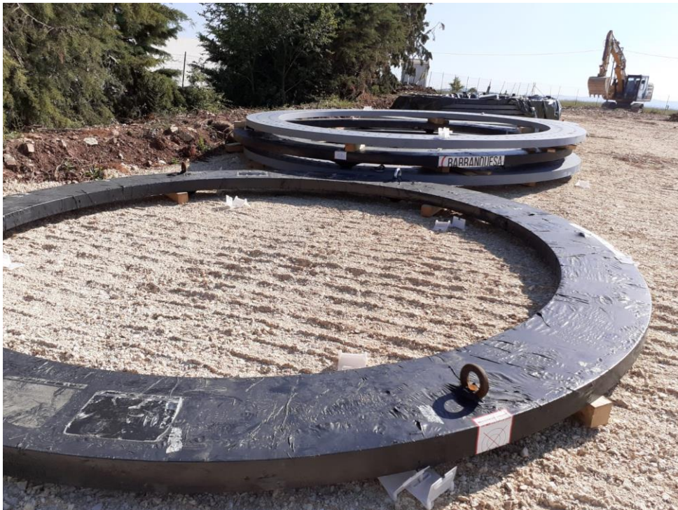
Figure 9-2 - Flanges delivered on site