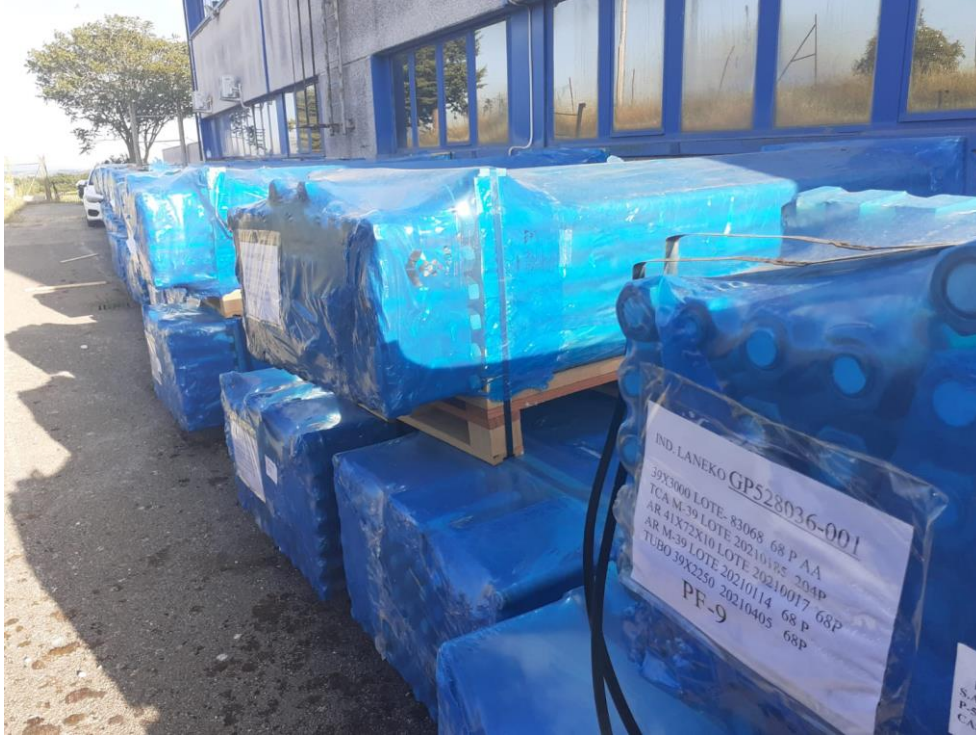
Figure 9-1 - Anchor bolts delivered on site

Here follow some pictures of the on-site delivery of Anchor Bolts, performed on June , 2021.