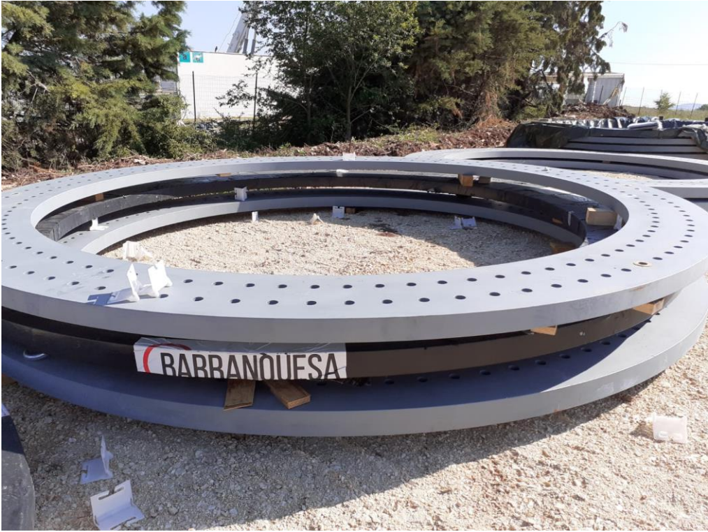
Figure 9-3 - Flanges delivered on site