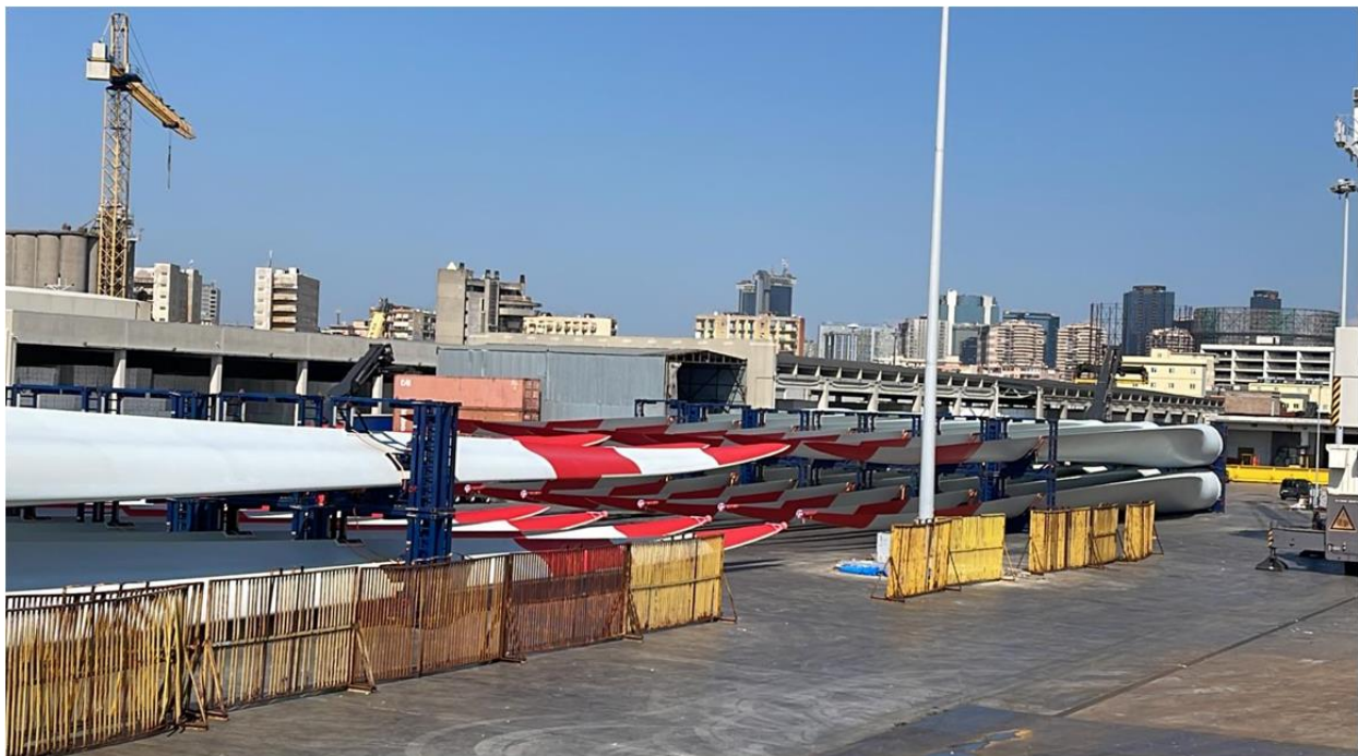
Figure 11-1 - WTG Blades at the port of Naples