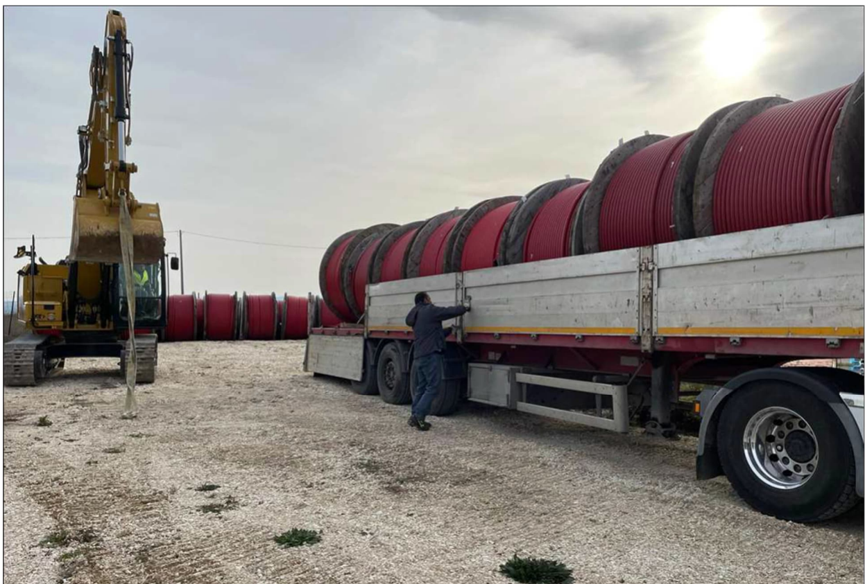
Figure 11-3 - MV cable unloading at site