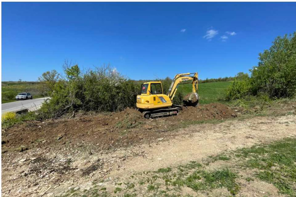
Figure 11-4 - Site track preparation activities