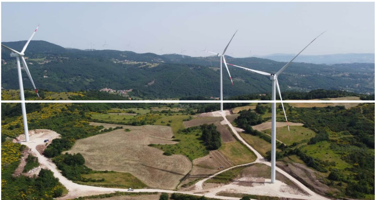
Figure 11-2 - WTGs 13-14-18