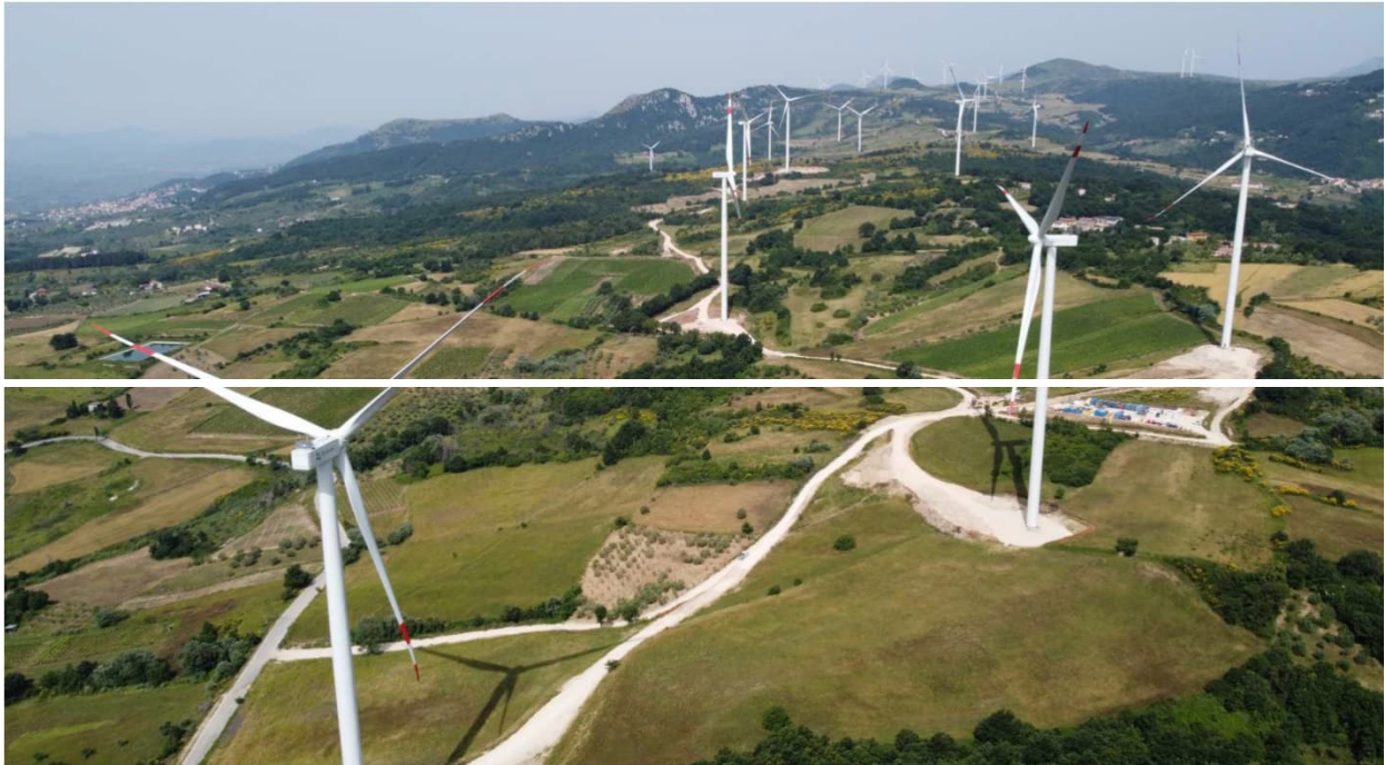
Figure 11-1 - north-west cluster

Some selected pictures of the site works and materials delivery, as shared by the Sponsor [4], are provided in this section.